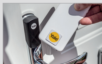
Phone Tag (Sold Separately)

For more information on Yale's Smart Living range visit: www.yale.co.uk/smart-living Find us on Facebook and Twitter or visit our blog at: www.yalesmartliving.co.uk